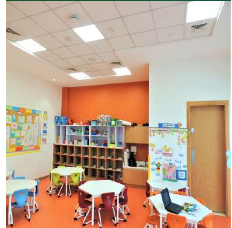
Amity School, Dubai, UAE.