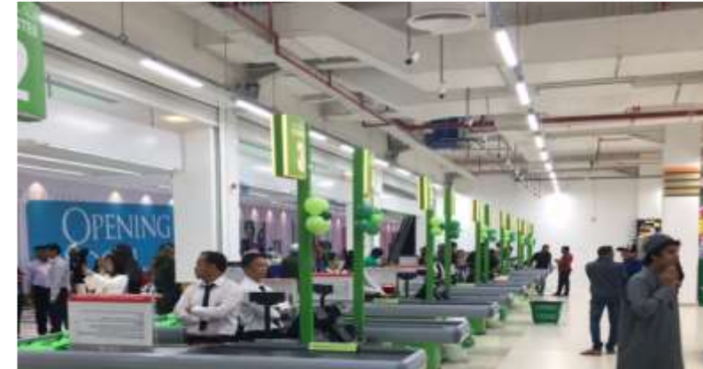
Central Mall, UAE