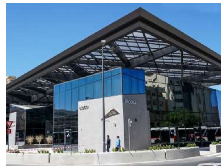
Abdul Razzak Al-Basir School, Kuwait