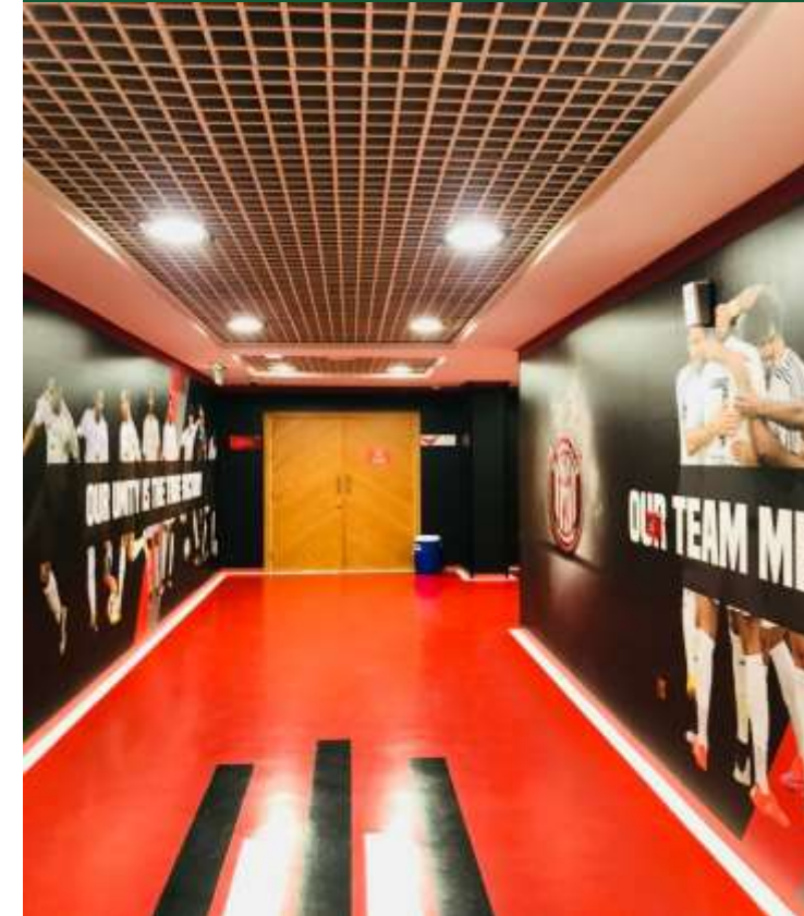
Al Jazira Club, Abu Dhabi, UAE.