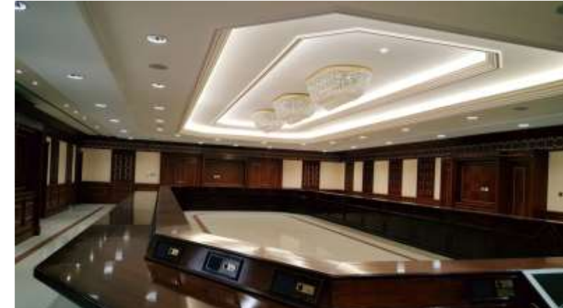
Ministry of Interiors, VVIP Hall, Oman