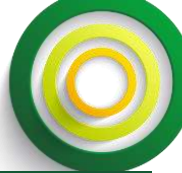
Amity School, Dubai, UAE.