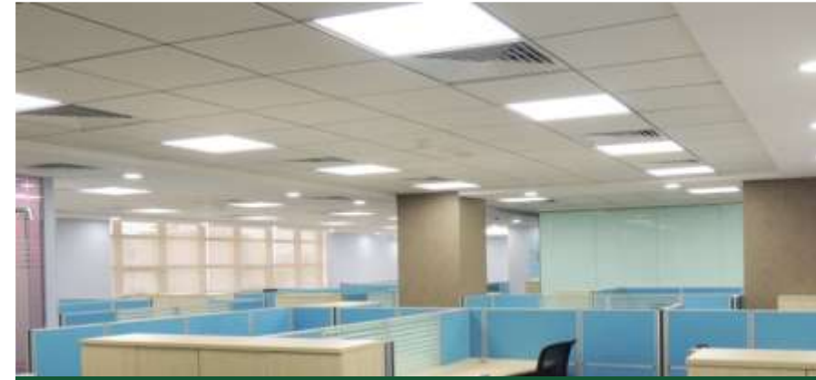
Jumbo Electronics, UAE