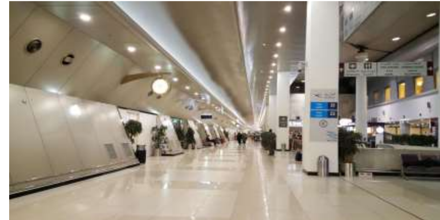
Kuwait International Airport, Kuwait