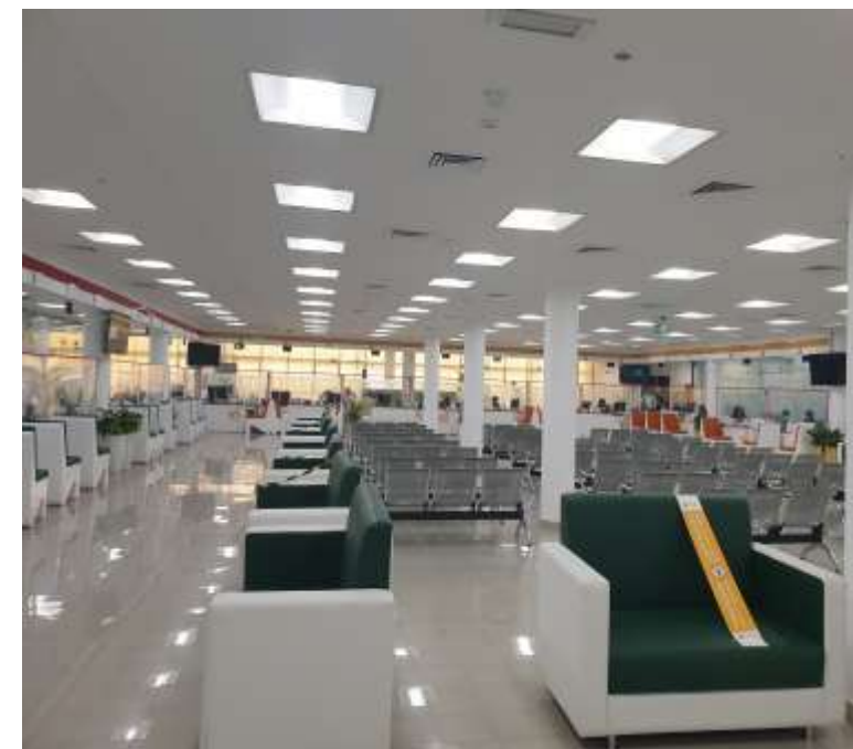
DM F&V Market Customer Centre, UAE.